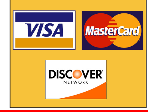
North Central Public Power District

For your convenience, North Central PPD now accepts Discover card as a form of payment. North Central PPD strives to provide its customers with a variety of payment options and this addition will give the customer more choices when it comes to paying their electric bill. Customers now have the option to pay with cash, check, E-check, automatic bank withdraw, money order, Visa, MasterCard or Discover.